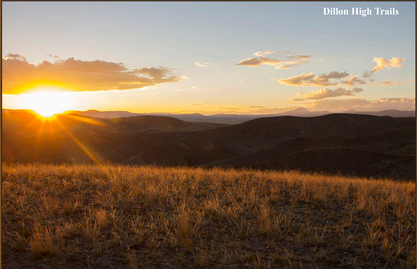
Dillon High Trails

Montana Fish & Wildlife Conservation Trust PO Box 1993 Helena, MT 59624 Phone: (406)458-0389 or email: fwctrust@mtwf.org www.mtconservationtrust.org