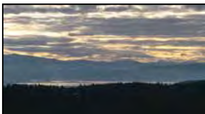
Foys to Blacktail Trail