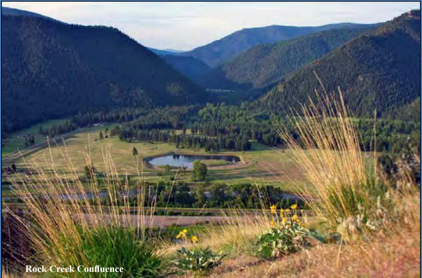
Rock Creek Confluence

Montana Fish & Wildlife Conservation Trust PO Box 1993 Helena, MT 59624 Phone: (406)458-0389 or email: fwctrust@mtwf.org www.mtconservationtrust.org