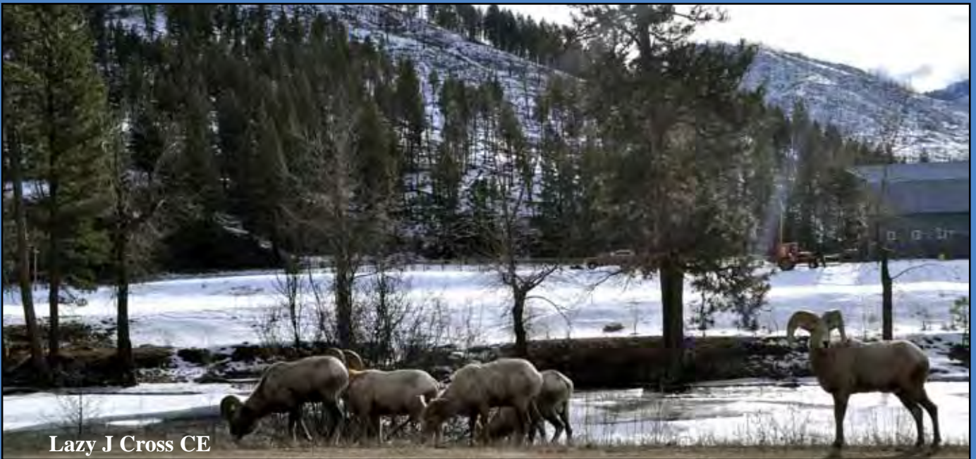
Lazy J Cross CE