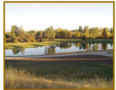
Robin Street Pond

The Trust value on 12/31/10 was $18,756,969.