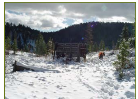
Reeb Mining Claim