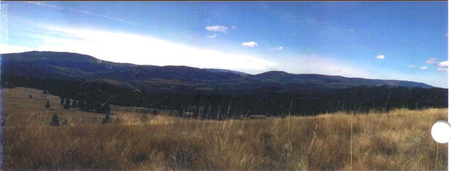
Blackfoot River Valley

Montana Fish & Wildlife Conservation Trust PO Box 1993 Helena, MT 59624 Phone: (406)458-0389 or Email: fwctrust@mtwf.org www.mtconservationtrust.org